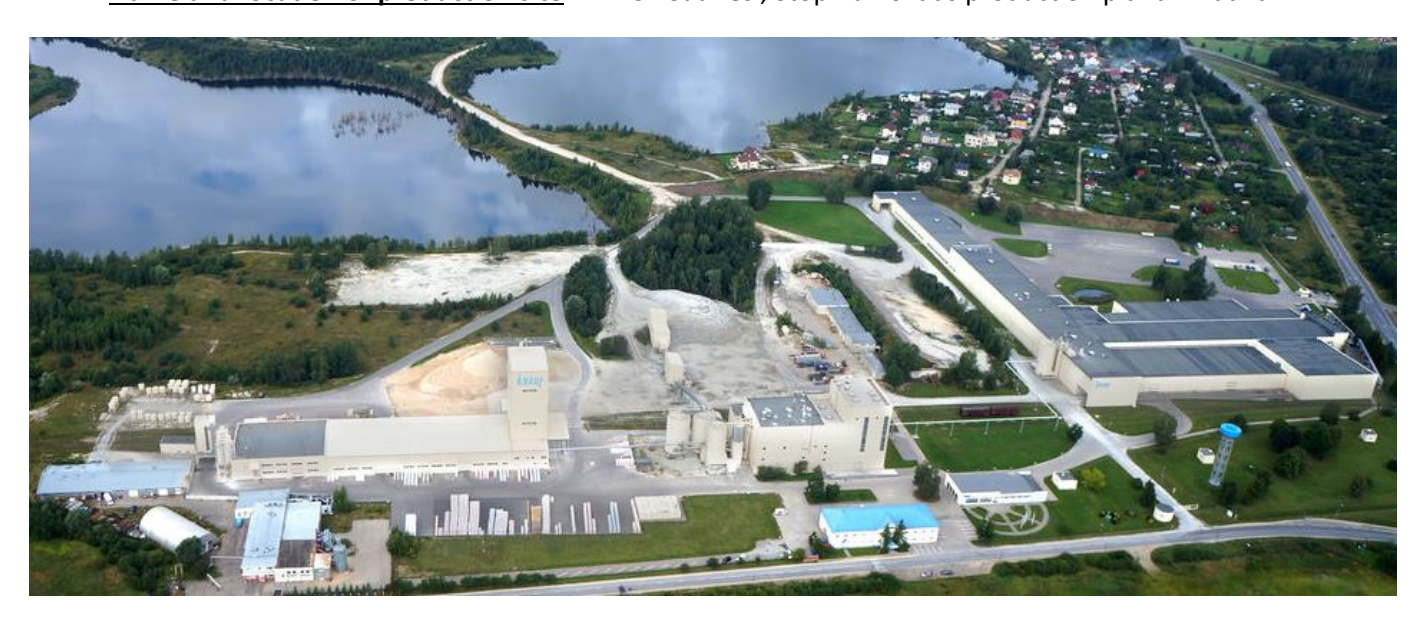
KNAUF Sauriesi, Stopinu novads production plant in Latvia

Name and location of production site: KNAUF Sauriesi, Stopinu novads production plant in Latvia.